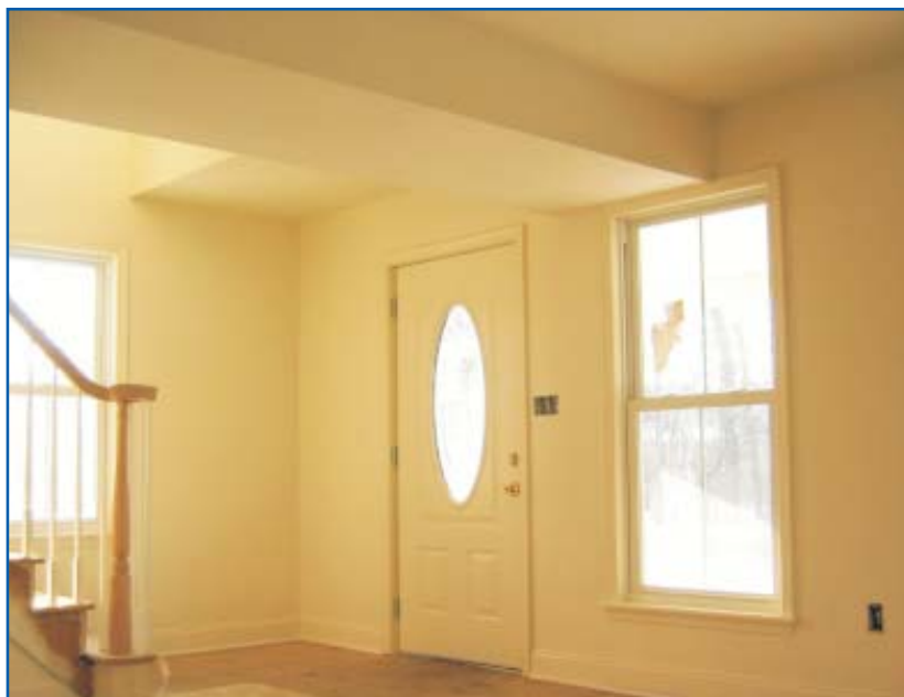
Energy efficiency windows and door in cottage

The additional cost of selecting energy efficiency features for the windows varies significantly between manufacturers. Generally, the added cost of low-E coatings and gas fill ranges from a low of a few dollars per window to nearly $100. But many manufacturers offer an energy efficient option that includes low-E coatings or a combination of low-E coatings and gas fill, for their windows at a cost of about $2/sf of window area. For the case study house with 196 sf of windows then, the additional cost for energy efficient windows is about $400.