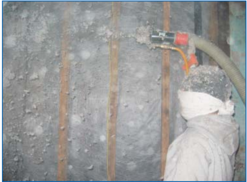
Blown cellulose insulation

The estimated installation costs 7 for blown cellulose insulation is approximately $0.43/sf with an additional $1.74/sf to drill holes for blowing access. The total installed costs then for installed blown cellulose insulation is about $2.17/sf of insulated wall area. Further, the estimated installed cost of the wall insulation of the case study house