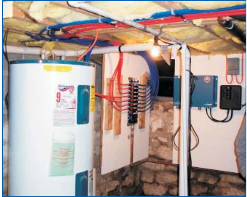
Hot water system in cottage

The original design for the water heating system was to include a “typical” propane-fired storage tank with an energy factor of approximately 0.56 located in the basement. While this would have been a relatively inexpensive option to purchase and install, the performance of this equipment, and expected standby losses due to its location in unconditioned space, would have cost significantly more to operate over its lifetime. The choice of