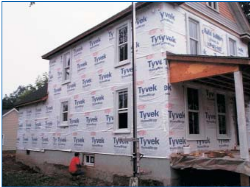
Air barrier on outside of house

that an additional 60% of heating and cooling energy would have been required to operate the home 10 .