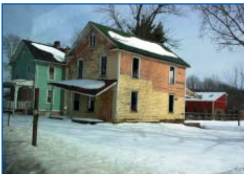
The site of the "gut rehab"

undertaken to develop and test the application of energy efficiency (EE) strategies, to evaluate the benefits, and to identify any weaknesses in their design or application. Taken together as a system, the strategies provide opportunities for energy and cost savings, increased