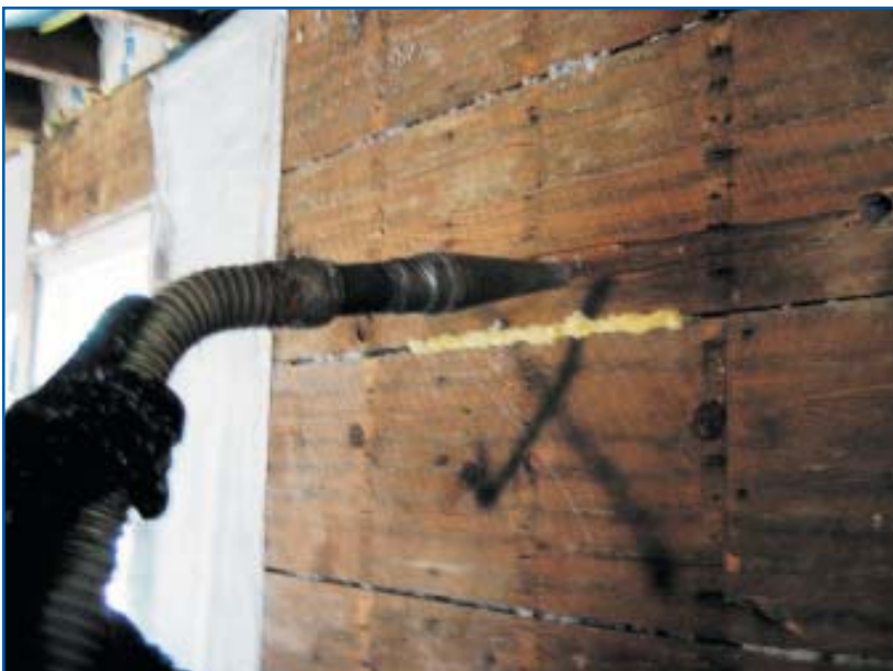
Insulation blown into wall cavities

with 1338 sf of retrofitted insulated wall area is $2,900.