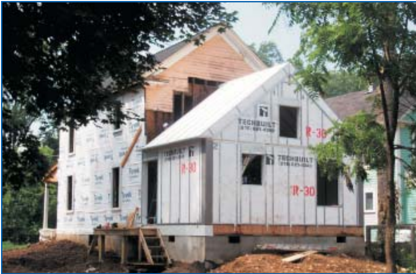
Addition constructed in 6 hours

addition with a vented attic. The choice to use structural panels allowed for the creation of a cathedral ceiling in the room and dramatically decreased the close-in time for the project. Once the conventional wooden deck had been built, it took the remodeler's crew of three, plus two support technicians from the panel manufacturer